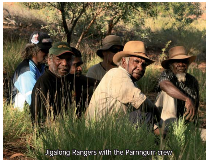
Jigalong Rangers with the Parnngurr crew