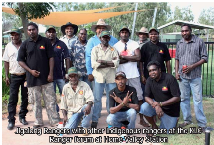
Jigalong Rangers with other indigenous rangers at the KLC Ranger forum at Home Valley Station