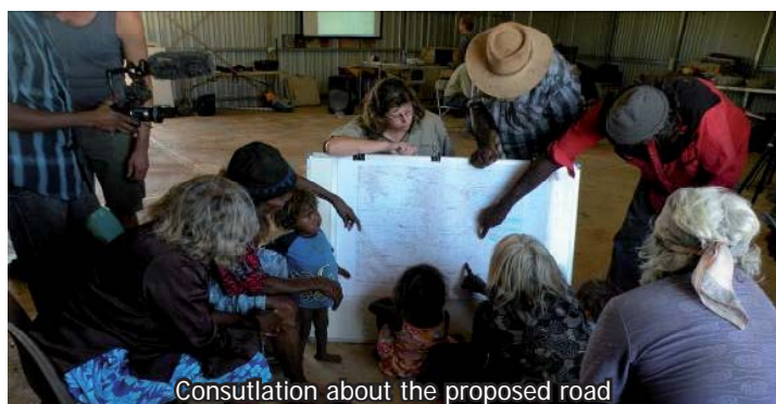
Consultation about the proposed road