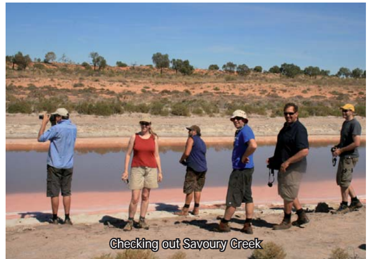
Checking out Savoury Creek

The whitefella mobs were very impressed with the rangers and how beautiful Martu country was.