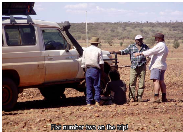
Flat number two on the trip!