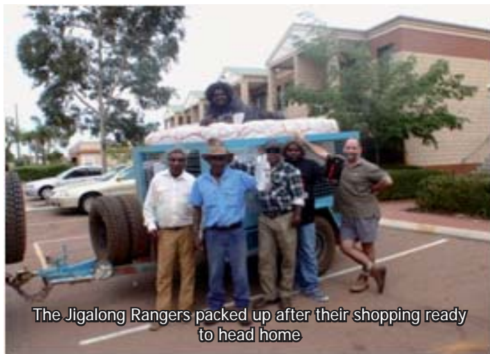
The Jigalong Rangers packed up after their shopping ready to head home

The Rangers travelled to Perth to buy equipment and collect two new Toyotas for Ranger work.