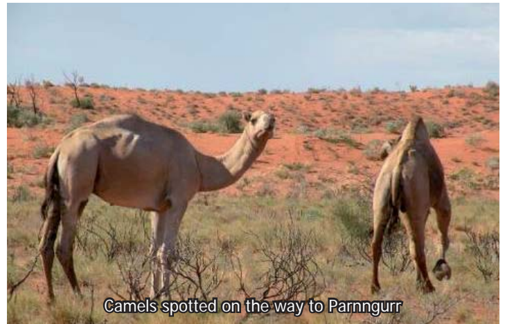
Camels spotted on the way to Parnngurr

We decided that camels should not be shot near rivers, roads or special places. Elders should be taken up in helicopters to decide where it is ok to shoot. This will take a while to happen because DEC needs to make sure shooting from helicopters is safe.