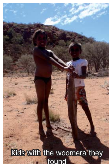
Kids with the woomera they found

At one waterhole where we conducted a fauna monitoring survey and water quality testing we found an old woomera.