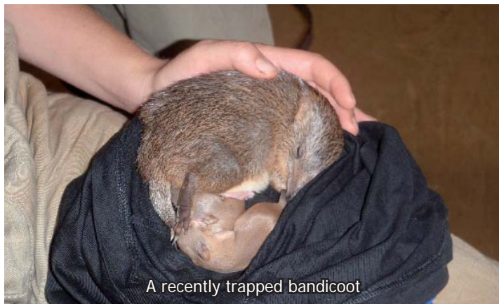
A recently trapped bandicoot

During the surveys we found evidence of echidnas, emus and an abundance of bustards and kangaroos. Unfortunately there was also evidence of numerous camels.