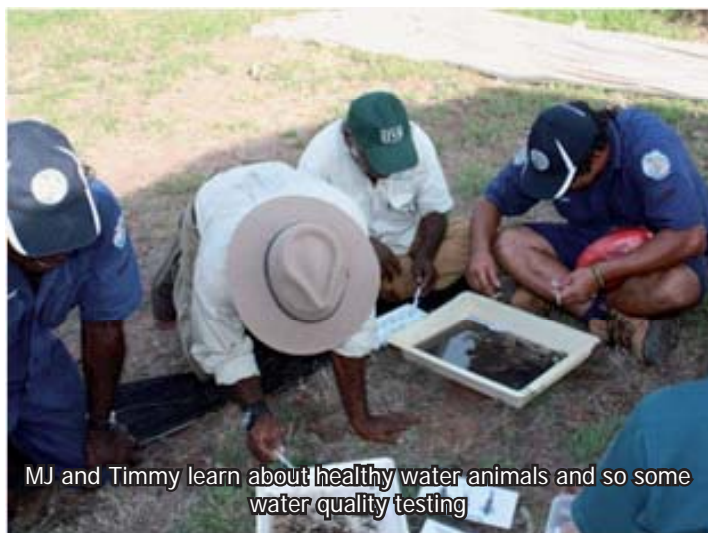
MJ and Timmy learn about healthy water animals and so some water quality testing