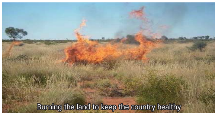
Burning the land to keep the country healthy