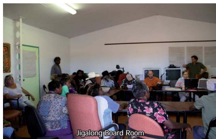
Jigalong Board Room