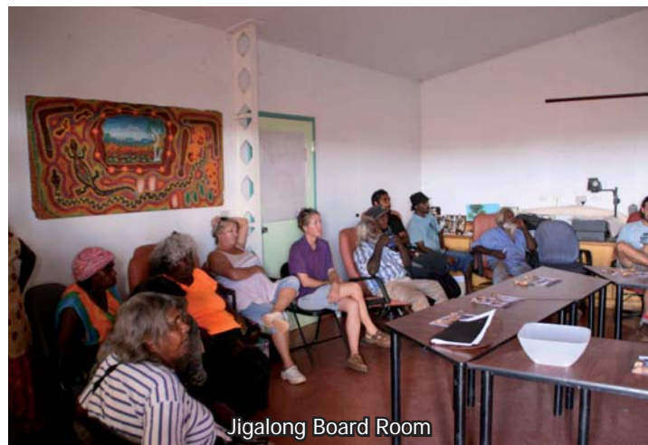
Jigalong Board Room