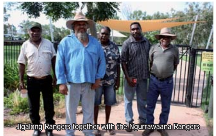
Jigalong Rangers together with the Ngurrawaana Rangers