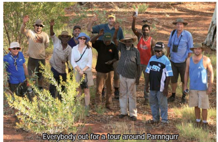
Everybody out for a tour around Parnngurr

Watch out for the next issue to see what the Parnngurr Rangers team have been up to.