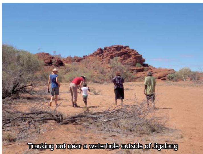
Tracking out near a waterhole outside of Jigalong

It was a very productive trip and we all feel very equipped to continue delivering the program this year.