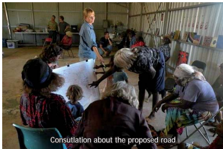
Consultation about the proposed road

We talked about the palya and walyku of the road belonging to the Shire or Martu. If it was a Martu road, only Martu could use it and tourists couldn't get to ngurlu places. But if there was an accident, no-one would be covered by insurance. Martu would also have to pay to look after it. If it was a Shire road, the Shire (or DEC) would have to pay to maintain it. But tourists would be close to ngurlu places.