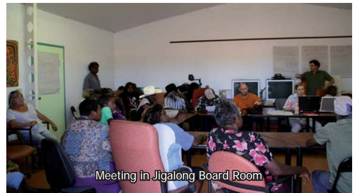
Meeting in Jigalong Board Room